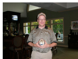
Longest Drive Winner