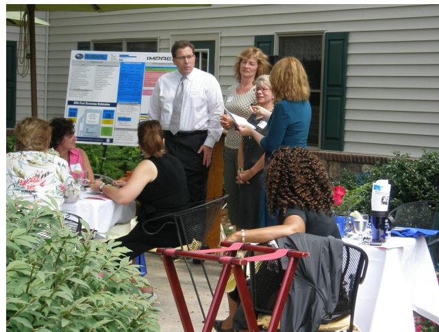
August Women in Business Luncheon at Grace Park Seniors Living Well