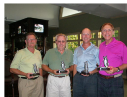
2nd Flight Winners