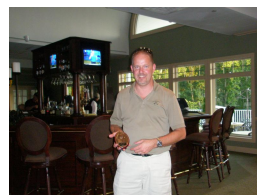
Closest to Pin Winner