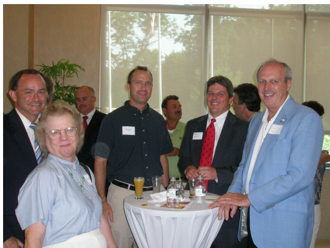
August Business Card Exchange at ESSA's corporate office in Stroudsburg

Everyone in attendance had a chance to sample the different Shawnee CraftBrews and wines and pairing them with various delicious appetizers, while networking with other Chamber members.