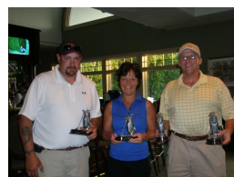
3rd Flight Winners