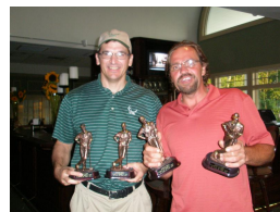
1st Flight Winners